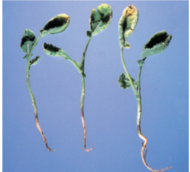
Figure 5a. Canola leaf cupping from Banvel injury.

Figure 5b shows Muster (ethametsulfuron-methyl) injury on canola. Muster is a registered herbicide (Group 2) on canola, but injury could occur if a heavy rainfall occurs shortly after spraying, facilitating the uptake of the herbicide via the roots.