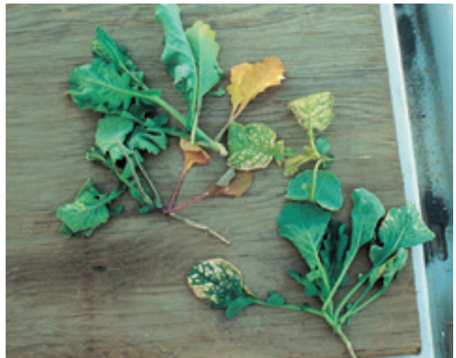
Figure 5b. Purpling of older leaves resulting from Muster sprayed just prior to heavy rainfall.

Other Group 2 herbicides such as Ally (metsulfuron-methyl) or Pursuit (imazethapyr) can carry-over in the soil and cause purpling of the older canola leaves. If Group 2 herbicides are sprayed directly on canola as a tank contaminant, purpling of the youngest leaves may occur.