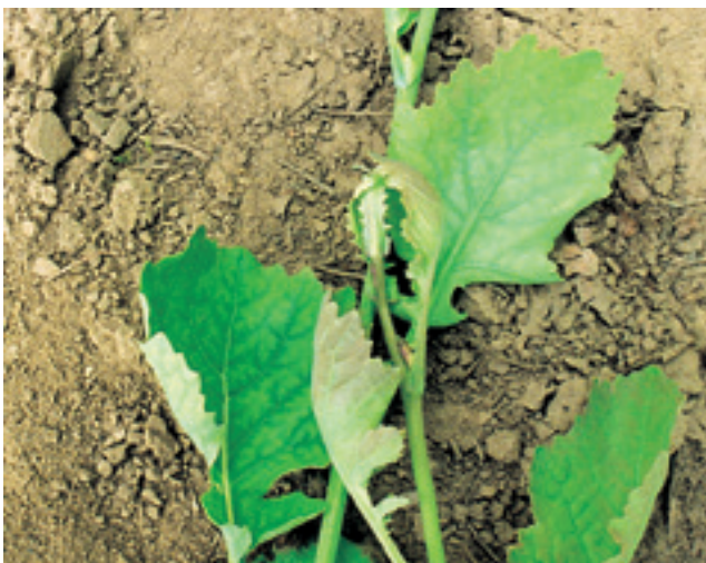
2c. Dark vein coloration and purpling of leaf margins.