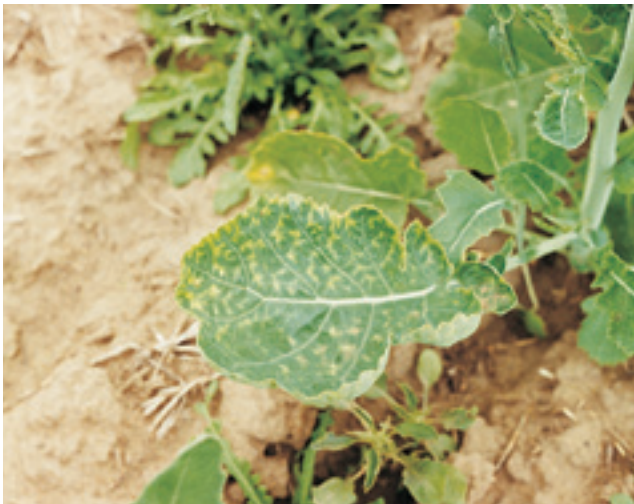
2b. Leaf cupping.