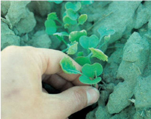
2a. Sulphur deficient seedling.