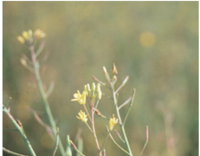
2d. Small pale flowers and poor pod development.

Sulphur deficiency in alfalfa results in shorter plant stature with pale green to yellow leaves (Figure 4a and b). The yellowing is often, but not always, localized to newly emerging leaves. Sulphur deficiency can result in nitrogen deficiency in alfalfa since S is required for health and function of nitrogen-fixing nodules. Sulphur deficiency in alfalfa occurs more commonly and is more severe in Gray Wooded soil.