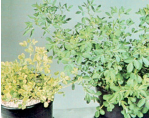
4a. Deficient alfalfa plant on left is shorter in stature with yellowing most severe on young leaves.