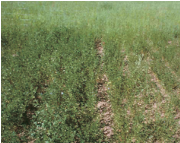
4b. In the field, sulphur-deficient alfalfa on the right.