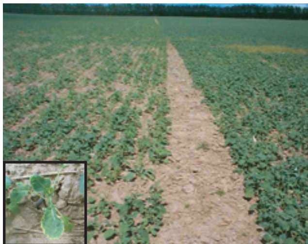
Figure 6. Canola grown from bare seed (left) versus Vitavax-treated (right).

Herbicide carry-over, acidic soil or a shallow hard pan soil layer can cause restricted root growth and restrict sulphate-S uptake, leading to deficiency symptoms. Root rot diseases, some of which are preventable with seed treatment, can cause the development of sulphur deficiency in canola (Figure 6).