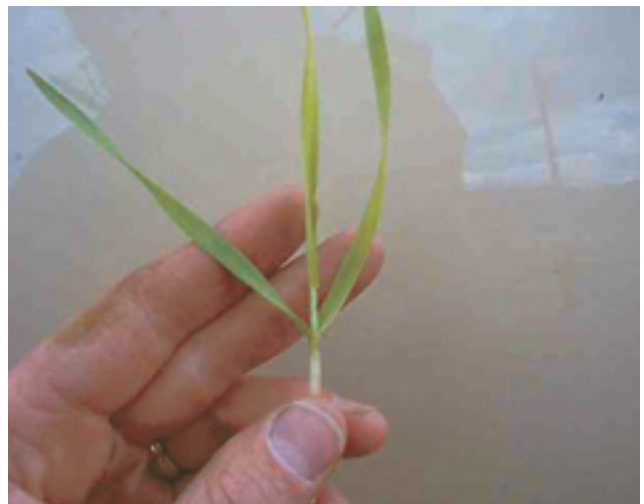
Figure 3. Yellowing of newly emerging leaves is an indicator of sulphur deficiency in wheat, other cereals and forage grasses.

Sulphur deficiency in alfalfa results in shorter plant stature with pale green to yellow leaves (Figure 4a and b). The yellowing is often, but not always, localized to newly emerging leaves. Sulphur deficiency can result in nitrogen deficiency in alfalfa since S is required for health and function of nitrogen-fixing nodules. Sulphur deficiency in alfalfa occurs more commonly and is more severe in Gray Wooded soil.