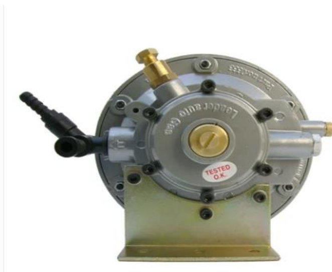
Fig 1.4: 2/3 Stroke Engine Conversion Kit

was some of the hardware selected and optimized suitable to CNG operation without compromising the base petrol performance. It was observed that the induction system optimization plays an important role in meeting the power performance and THC emission targets due to scavenging. Engine can be optimized with a three-way Palladium based catalytic converter (instead of Pt based Cat Con) to meet proposed BS-III norms (Shanmugam et al., 2009)