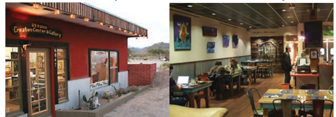
Mojave Moon Cafe