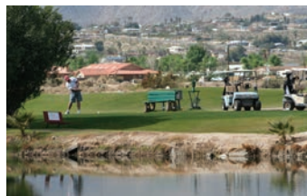
Roadrunner Dunes

Desert Winds Golf Course: 18-hole championship-rated course operated by MCCA aboard the Marine Corps Air Ground Combat Center, 29 Palms. 24/7 driving range, putting greens, 6,908 yards from longest tees for Par 72. Open to public, daily 6 to 6. Clubhouse, Sand Trap Grill. (760)830-6132.