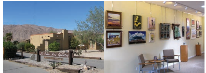
29 Palms Art Gallery