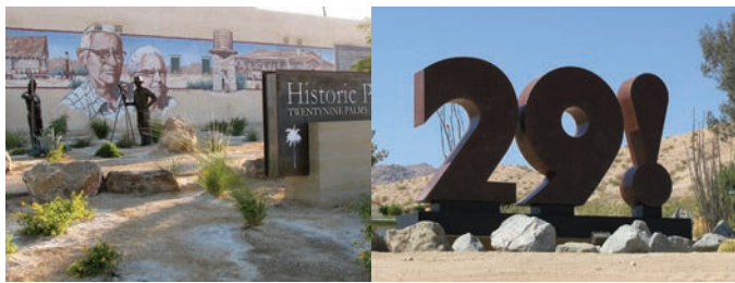
(See MAP on page 17 for locations of murals and public art in the city.)