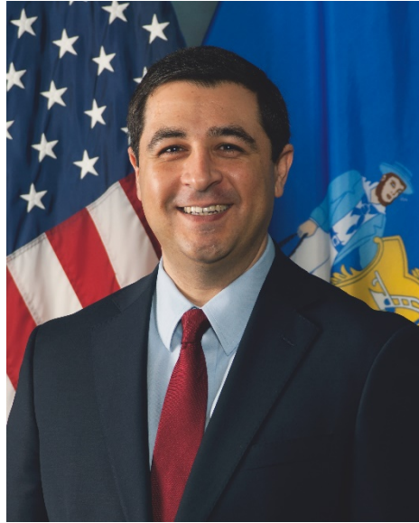
Attorney General Josh Kaul