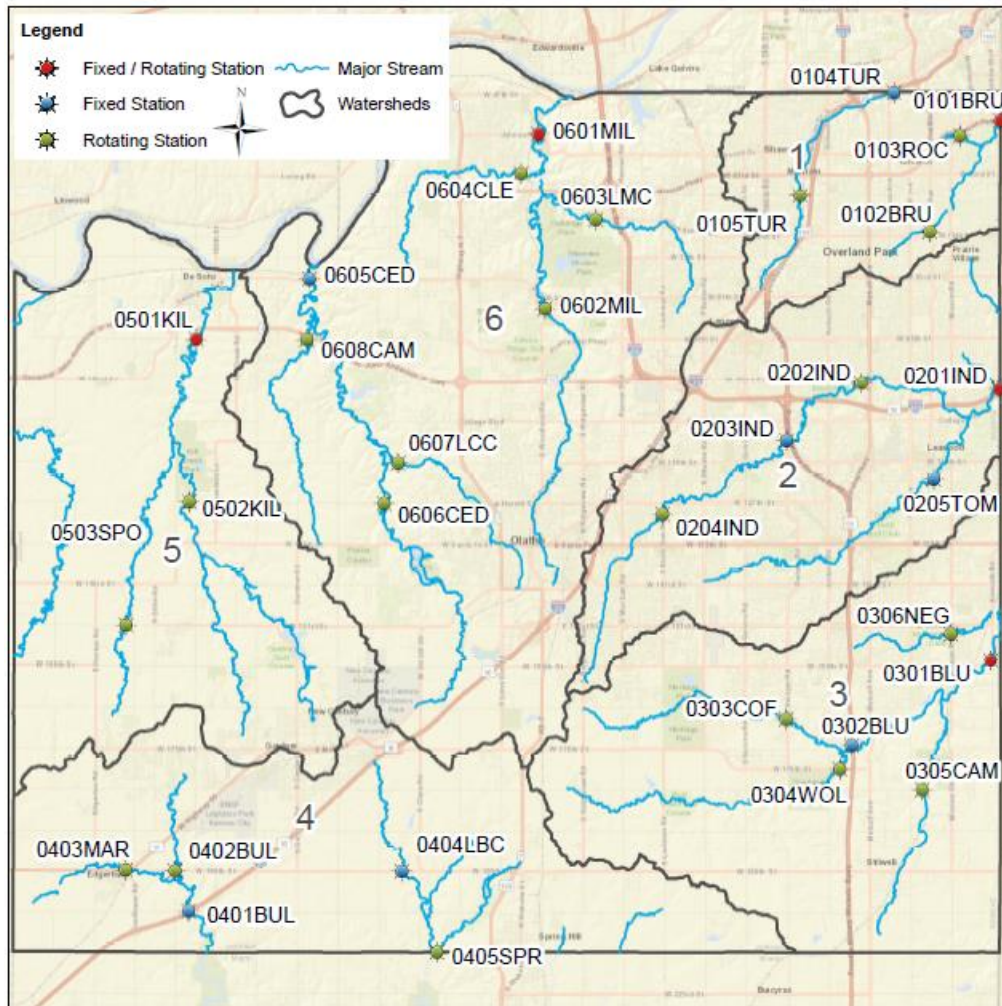
Figure 1. Locations of Fixed and Rotating Monitoring Stations